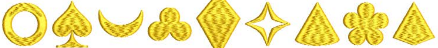
Keystroke f g h i j l m n o