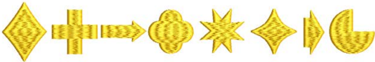
Keystroke X Y Z a b c d e