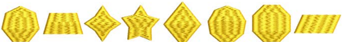
Keystroke H I J K L M N O