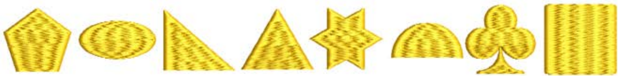
Keystroke P Q R S T U V W